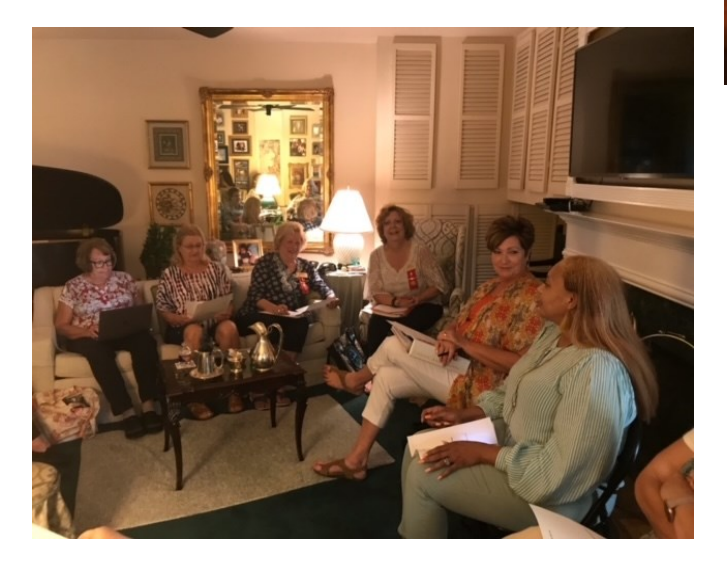
Our membership focus includes a new contest between the Thetas and the Lambdas , and everyone was assigned a rose buddy .