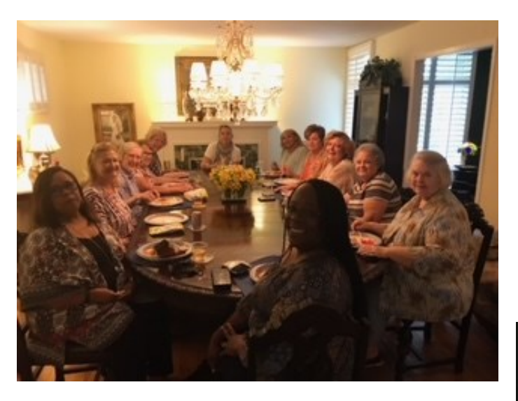
Theta Lambda members enjoy a delicious meal at the first chapter meeting.