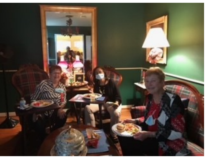
Members introduce themselves to two guests.

~ a time for planning and sharing with much laughter and many beautiful smiles.