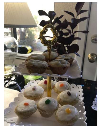
So many scrumptious treats to enjoy!