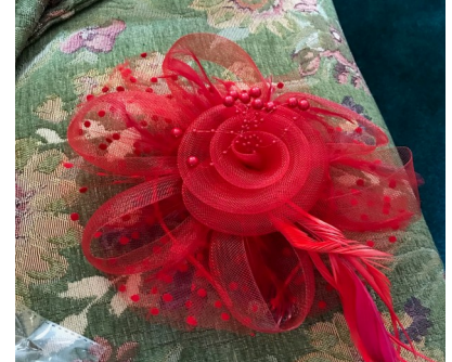
Guests sat down to a festive Tea, properly adorned in beautiful fascinators