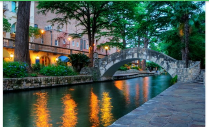
er / CC BY-NC-SA