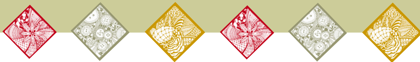
Pictures from 2014 auction

You won't want to miss this fun and festive event that incorporates one of a kind handmade gifts, delectable treats, and creative crafts. We encourage everyone to participate as we raise funds for our chapter programs, scholarships, and charities. Bring your friends and let's make this auction our biggest and best! See you November 16 th !